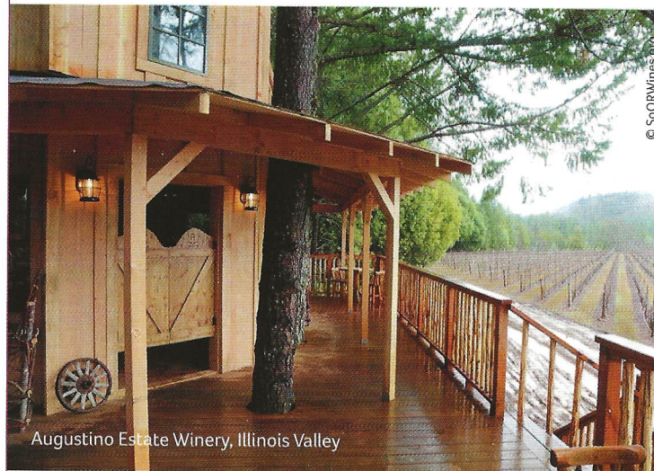
Augustino Estate Winery, Illinois Valley

Elk Creek Tunnel State Scenic Corridor is part of the Umpqua Hwy (OR 38). Follow this toward the coast and you will come to Brandborg Vineyard & Winery