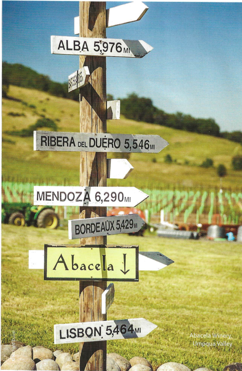
Abacela Winery, Umpqua Valley

Abacela Winery specializes in growing Southern European varietals; in good humor, this sign post on the property gives the mileage to those growing regions.