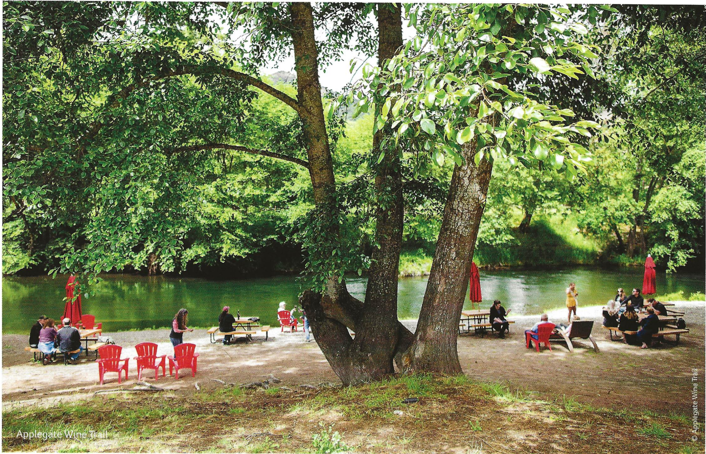
Applegate Wine Trail