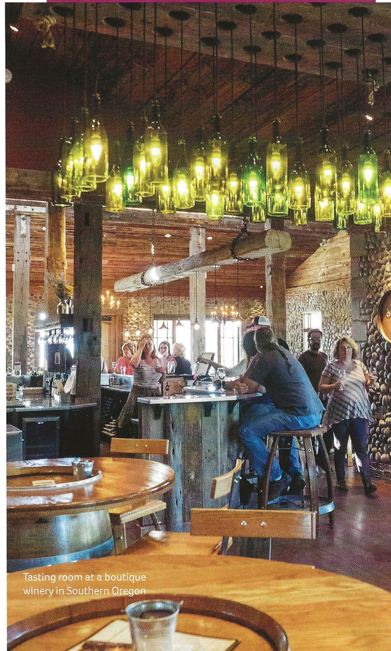
Tasting room at a boutique winery in Southern Oregon

Which of the five AVAs are the best? You’ll have to go yourself to find your favorite. It’s a tough job, but someone has to do it—it might as well be you. Learn more about Southern Oregon’s wine regions and the wineries to visit at southernoregonwines.org . Plan your trip to Southern Oregon by visiting southernoregon.org .